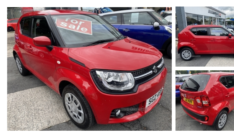
No extra VAT for our Southern customers.

Bluetooth handsfree with music audio streaming, DAB Digital Radio, Automatic Headlamps, Privacy glass, Air conditioning, ISOFIX child seat anchor points, LED Projector Headlamps, ESP -Electronic Stability Program, TPMS - Tyre Pressure Monitoring System, Electric mirrors, Electric windows, CD player with Aux and USB ports, Front fog lights.