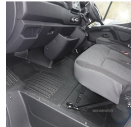
2021 Vauxhall Movano L3 H2 panel van with 46666 miles . In very good condition inside and outside .