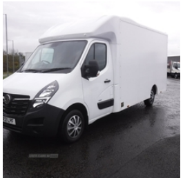
2021 Vauxhall Movano 14ft Lo Loader Luton with 44467 miles . Air con . In excellent condition inside and outside .