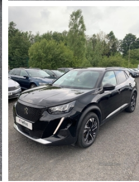
*Viewing by appointment*