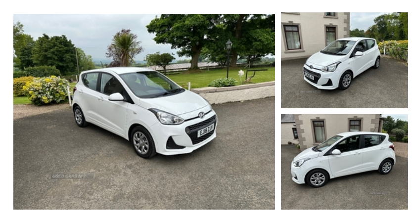
We are pleased to offer this 2018 Hyundai i10 1.0 petrol sold with a full years MOT.