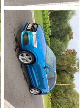
2016 AUDI Q3 2.0 TDI S-LINE QUATTRO