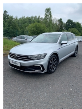
*Viewing by appointment*