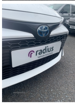
*Viewing by appointment*