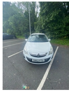
2012 Vauxhall corsa ecoflex 73,100 miles 1.0 petrol 3 door Low insurance group £30 tax Mot until sept 2024

Driven this car for 6 years and only put 30,000 miles on it . Great running car never had any issues with it. Only reason for selling is upgrading.