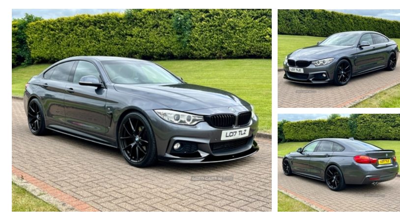
April 2017 BMW 420d Gran Coupe M-Sport in Mineral Grey. Full Service History. Mot'd to June 2025.

Loaded with spec including Full Black Leather Interior, Pro-Navigation System, Xenon Lights, Parking Aid, Bluetooth, DAB Radio, Dual Climate Control, On-Board Computer, Central Armrest, Cruise Control, M-Performance Kit, Privacy Glass etc.