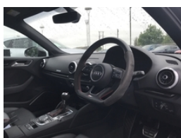
Audi RS3 2.5T FSI RS3 Quattro 5dr S Tronic