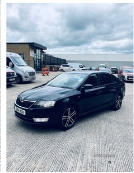
2014 Skoda Rapid Black Edition Tsi 1.2, 103bhp

Only 70k miles with a part service history, just serviced