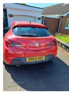
Astra gtc 1.4turbo good condition new timing chain and water pump and service recently