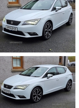
2014 Seat Leon 1.6 tdi SE Technology

86,000 miles Full service history including timing belt kit done 84k MOT to 8/OCT/24 £0 TAX 1.6 tdi 105bhp 5 speed manual diesel