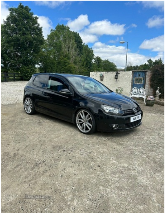
1.6l mk6 golf only selling due to moving away

Mot to November, passed with no minors last time.