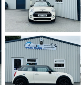
2017 Mini Cooper SD 2.0 Diesel 168 Bhp 6 Speed Manual