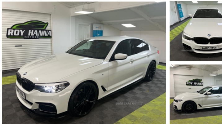
A truly beautiful, practical and economical 2017 BMW 530d M Sport with full M Performance kit just arrived at Roy Hanna Motors!