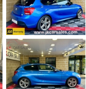
2013 BMW 1 Series 116D M Sport

2.0 Diesel 116BHP 6 speed manual 100k miles with full service history MOT 04/06/2025 3 Months warranty £35 Road TAX 2 keys Just fully serviced Trade ins welcome