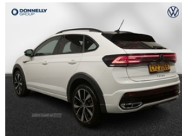
Volkswagen Taigo 1.0 TSI 110 R-Line 5dr