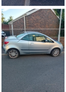
MOT'd until July 2025 Drives well, low mileage for age Bodywork in good condition Two keys