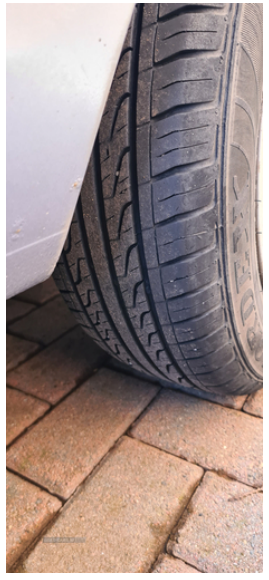
For sale 2008 Vauxhall Corsa 1.3 CDTi Breeze 3dr 116000 miles Diesel 1.3 L Manual .

I'm selling my corsa because I got another car runs well.the car had for mot new tyres and batery.car has small dents and scratches age related.