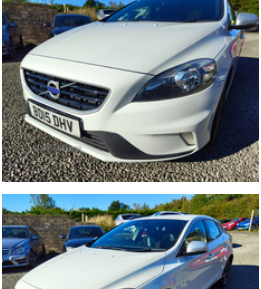
**For Sale: 2015 Volvo V40 D2 [120] R-Design 5dr**