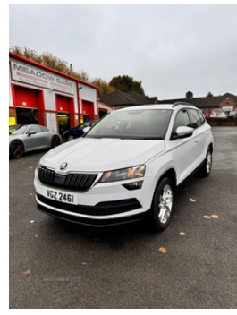
Just arrived appleplay,android,reverse sensors,bluetooth,fsh and one owner