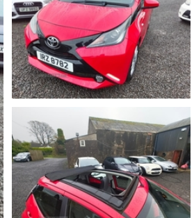
**2015 Toyota Aygo X-Pression - Perfect for City Driving!**

Looking for a reliable, economical, and stylish ride This **2015 Toyota Aygo X-Pression** might just be your perfect match! With **88,000 miles**, it's been well-maintained and is ready for many more journeys.