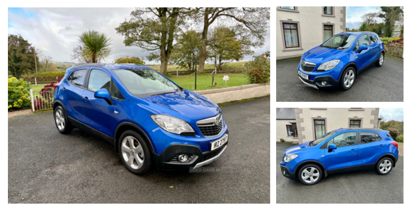
Ready for viewing is this Vauxhall Mokka 1.7cdti exclusive in excellent condition throughout.

Finished in Metallic blue paint FULL YEARS MOT