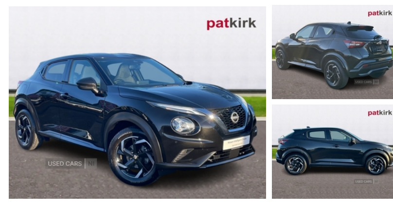
Nissan Juke 1.0 DiG-T 114 N-Connecta 5dr