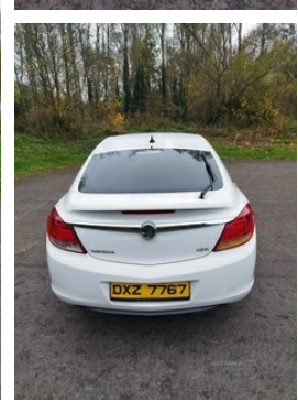
Insignia 2.0 Sri 158 cdti 149209 miles Mot till August 25 New glitch and fly wheel Dpf deleted Slight surface rust Car driving and going perfect Give no bother over the years £1500 ono