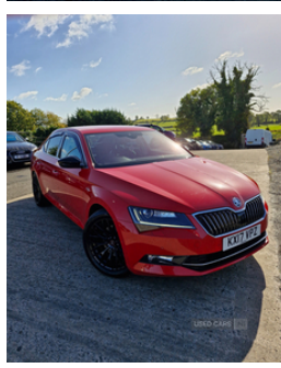
Skoda Superb 2.0 TDI CR 190 Laurin & Klement 5dr DSG

2017 2.0L DIESEL SEMI-AUTOMATIC 2 KEYS CORRIDA RED SPECIAL GLOSS PAINT 106,257 MILES MOT UNTIL MARCH 2025 £11,250