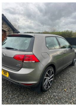
Recently serviced, MOT until 11th March 2025