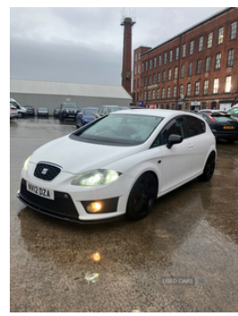
2012 Seat Leon Fr Plus Cr Tdi, 2.0, 170 bhp

113k miles with a 7 stamp service history, just serviced