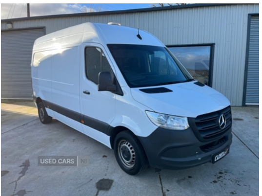
2021 Mercedes Sprinter SPRINTER 314 CDI PROGRESSIVE 2.1 CDI 140bhp

MOT until FEB 2025 (Can be sold with full year MOT)