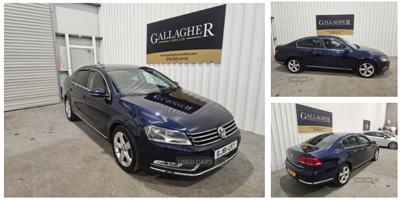
2011 Volkswagen Passat 2.0 Tdi SE Bluemotion Tech

102k warranted miles with a folder of history including a recent timing belt kit and comes freshly serviced by ourselves.