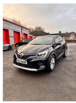
Just arrived, satnav, Bluetooth, reverse sensors, fsh and one owner