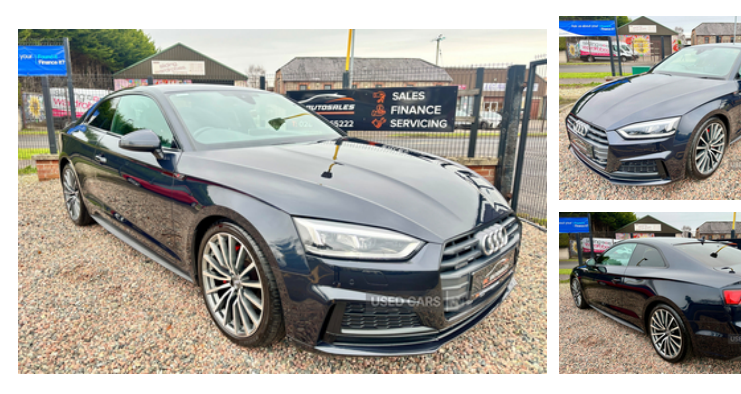
2017 Audi A5 Coupe 3.0 TDI Quattro

3. 0 TDI / QUATTRO / METALLIC MOONSHINE BLUE