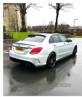
PERSONAL REGISTRATION REMOVED REG IS BX66ZBL

SEPTEMBER 2016 MERCEDES C220 AMG LINE PREMIUM