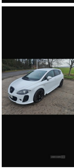
2011 1.6 Seat Leon CR TDI 1 Lady Owner from 32.000 miles Currently 126k miles Full Service History BTCC Factory Body Kit £20 Road Tax Low Insurance Group Recently serviced MOT'd July 2025 Alloys refurbished by Nu Look Wheels in Carrickfergus (Receipt