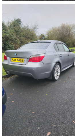
BMW 535d pre lci Low miles for age 127000

Car has been remapped by torquetronix by previous owner to around 350 bhp. Very fast car but can still be easy on diesel Swirl flaps removed